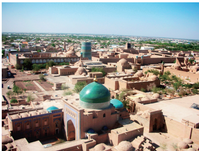
Khiva from the highest minaret.