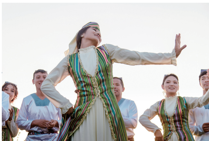
Uzbek dance in Ferghana.

heritage of the Silk Roads through the lens of their camera. Selected from the Contest and taken in different cities of Uzbekistan, including Samarkand, Tashkent, Bukhara and Shiva, Fergana, etc., photos of the exhibition present Uzbekistan through different perspectives: architectural sites, cuisine, textiles and clothing, music and dance, and people's lives.