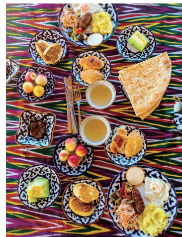
Hearty traditional Uzbek breakfast outside the old city of Khiva.