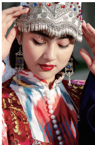
A Tashkent Girl.

As an important cultural and trade center along the Silk Roads, Uzbekistan has a history of migration and exchanges over the centuries. The Silk Road Week in 2022, therefore, invites Uzbekistan as the guest of honor to fully showcase its Silk Road characteristics. The UNESCO Silk Roads Programme is dedicated to promoting exchanges and understanding among different cultures along the Silk Roads. Organized within the framework of the Programme, the annual Youth Eyes on the Silk Roads International Photo Contest, launched since 2018, offers an exciting opportunity for young people from all over the world to capture their understanding of the shared